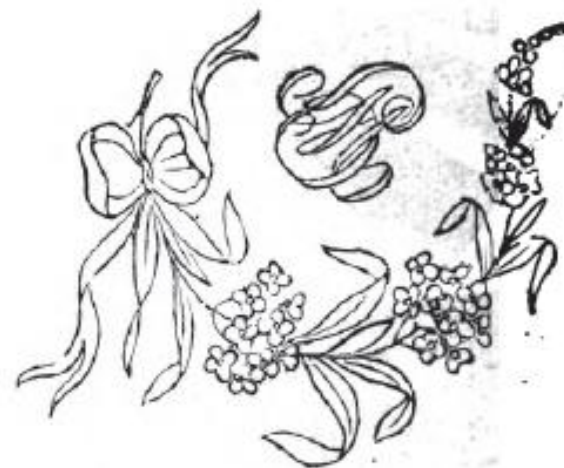
HANDKERCHIEF CORNER AND INITIALS.