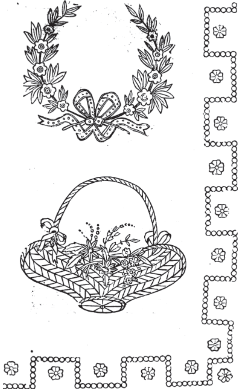
HANDKERCHIEF BORDER AND CORNERS: IN RED OR BLUE EMBROIDERY.