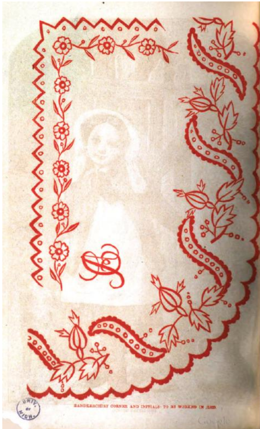
HANDKERCHIEF CORNER AND INITIALS TO BE WORKED IN RED.