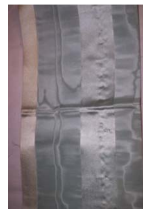
This ribbon could be mimicked by combining two 1" moiré silk ribbons, a 1" satin ribbon and a coordinating 1" satin ribbon.

A handsome, and easy ribbon can be created using a patterned 2" ribbon in the center and plain 1" ribbon on both sides. The center ribbon could be plaid or floral. Another can be created from a solid center ribbon bordered by coordinating striped ribbons. The center could be wide or narrow.